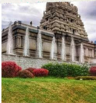
LORD KRISHNA ISKCON TEMPLE