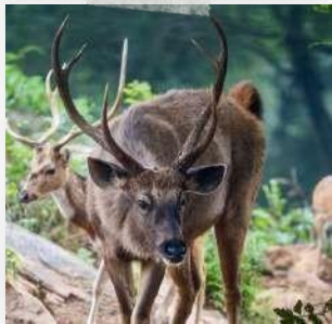
BANNERGHATTA BIOLOGICAL PARK