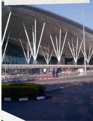
KEMPEGOWDA INTERNATIONAL AIRPORT