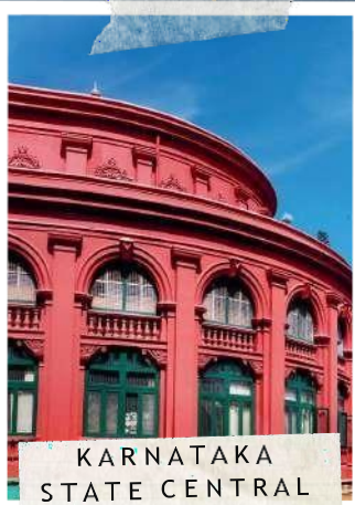
KARNATAKA STATE CENTRAL LIBRARY