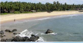
Someshwara Beach - Ullal