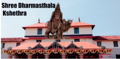
Shree Dharmasthala Temple