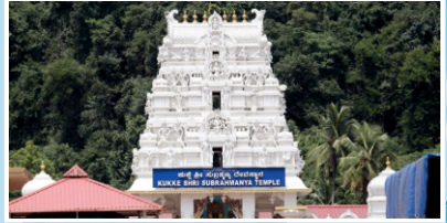
Shree Kukke Subrahmanya Temple