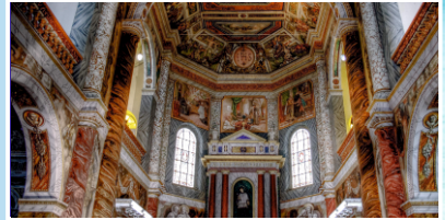
St. Aloysius Chapel