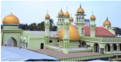
Sayyed Madani Darga - Ullal