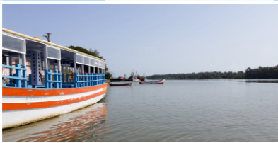
Ferry Ride - Sulthan Battery