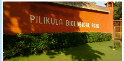
Pilikula Biological Park